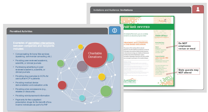
Games and interactivities